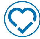
BETTER HEARTS BETTER CITIES