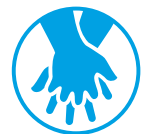
INTERNATIONAL ECC & RQI