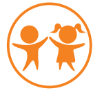
HELPING CHILDREN SURVIVE