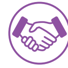
GLOBAL PUBLIC HEALTH ORGANIZATIONS