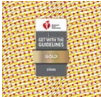
Background with pattern