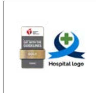
Does not allow sufficient area of non-interference