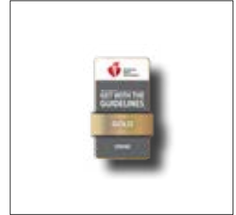
Use of special effects